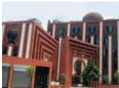
Sonakanda playground Pak Panjatan Jame Masjid