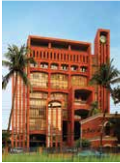
Bangabandhu's Memorial Paikpara Mutual Club Nagar Bhaban