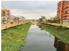
Kolrob Kindergarten School Baburail Canal