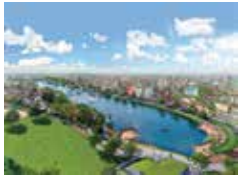
Ali Ahmmad Chunka City Library and Auditorium Sheikh Russell Park