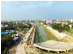
City Welfare Ground Siddhirganj Lake